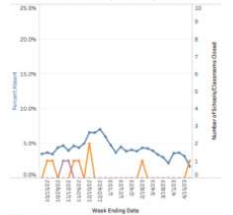
Percentage of Students Absent due to any Reason and Number of Schools Closed due to illness, by Week Ending Date, 2022-23

Sign up for Alerts: https://service.govdelivery.com/accounts/NESTATE/subscriber/new?qsp=2931